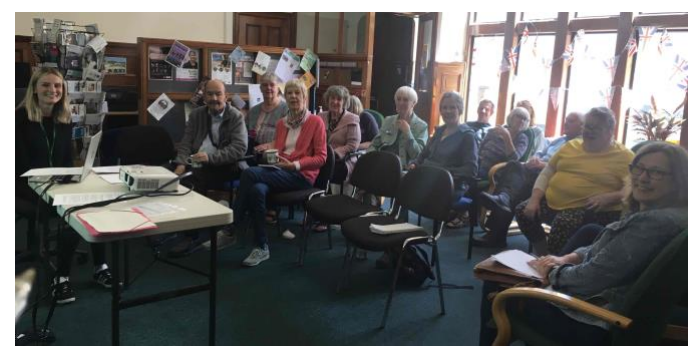
Thanking our volunteers

There will also be a Trussell Trust course on the Benefits system and Wiltshire Money Course on PIP applications.